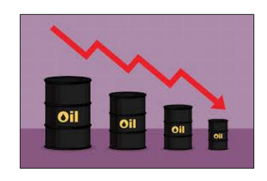
Crude oil price