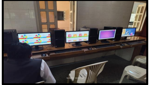
Computers donated to Dayadara School for "Promoting Education" Investor Presentation 6th Feb 2023