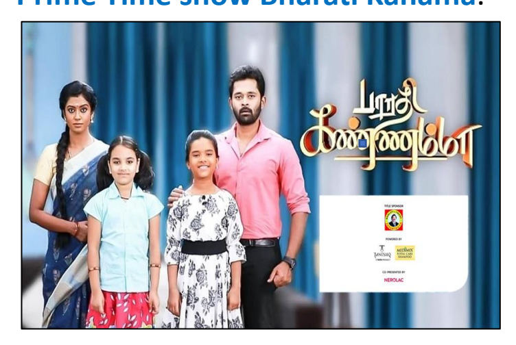
Presence in Entertainment channels